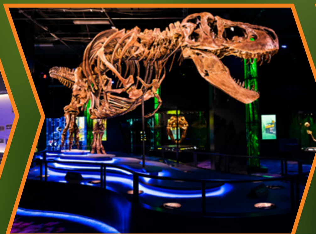
VICTORIA THE T.REX Melbourne Museum