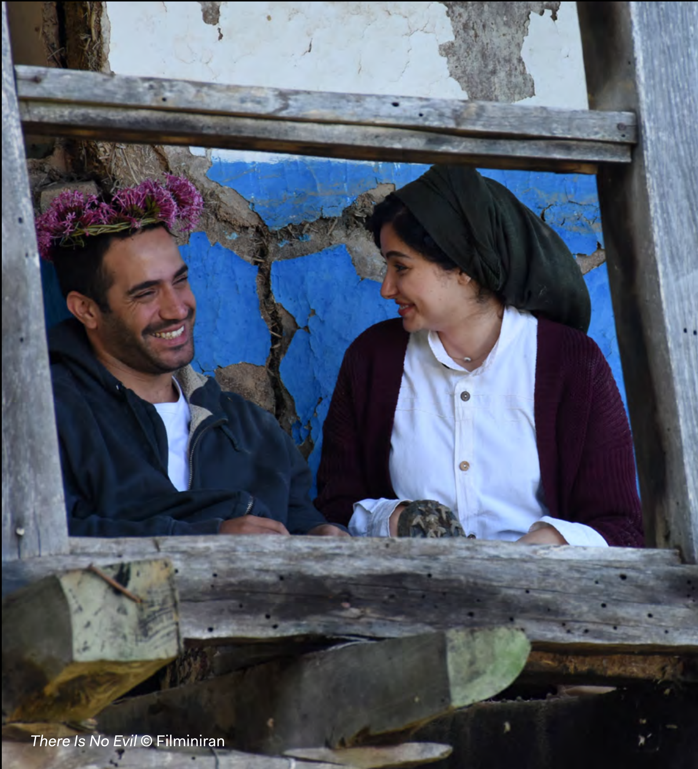
There Is No Evil