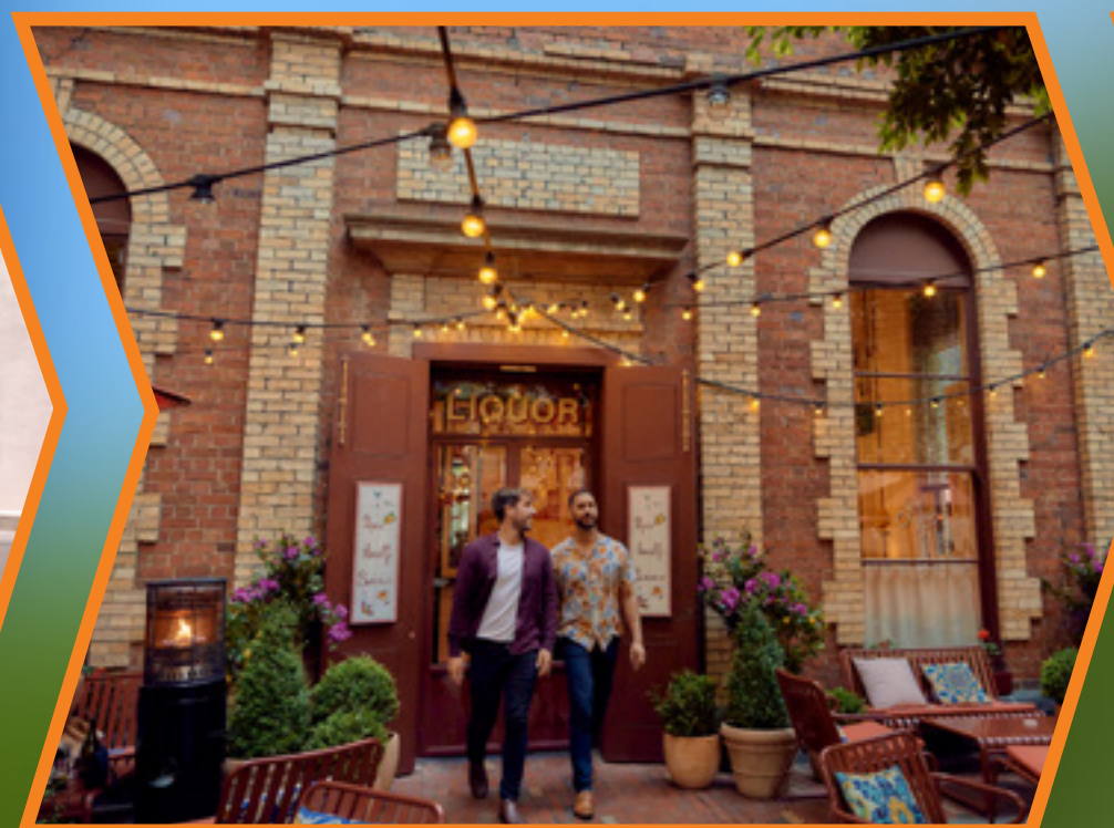
PEPE'S ITALIAN & LIQUOR Exhibition St