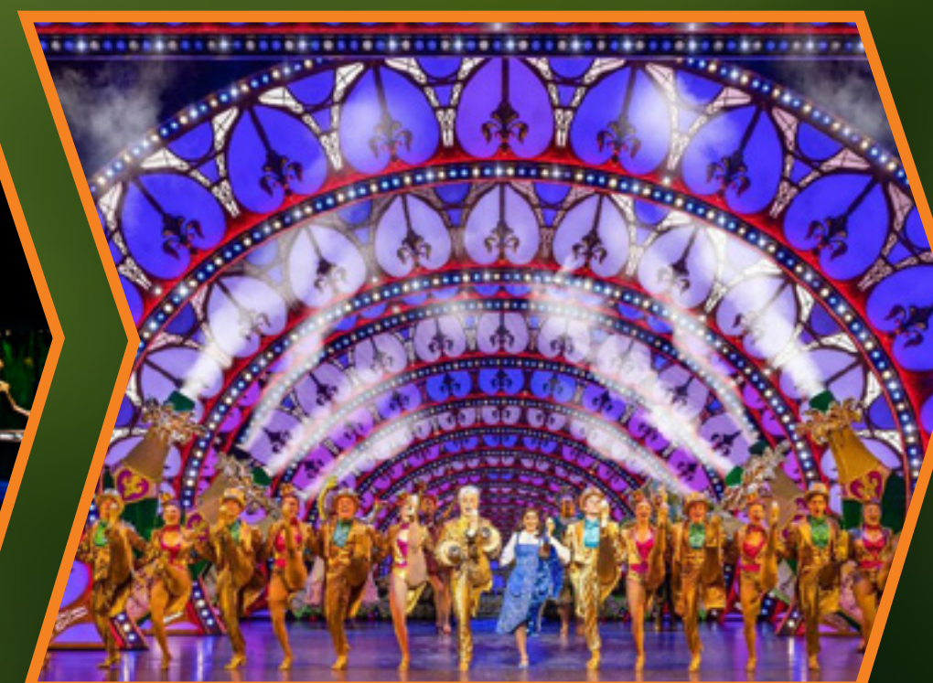
DISNEY'S BEAUTY AND THE BEAST Her Majesty's Theatre