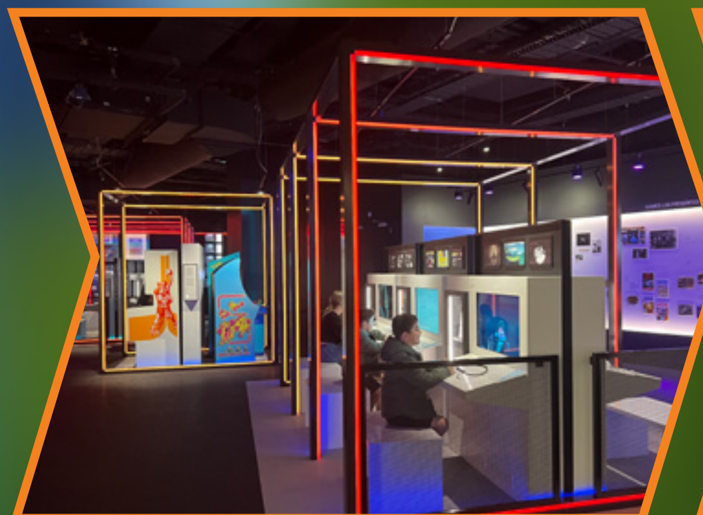
ACMI Flinders St