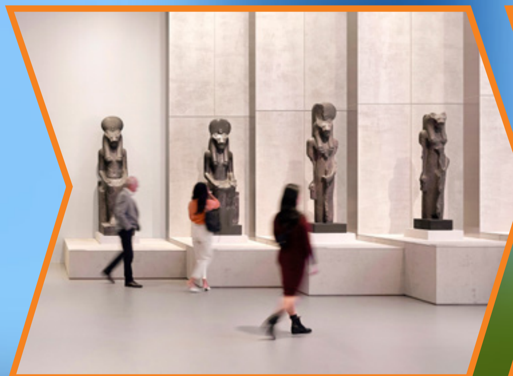
PHARAOH NGV International